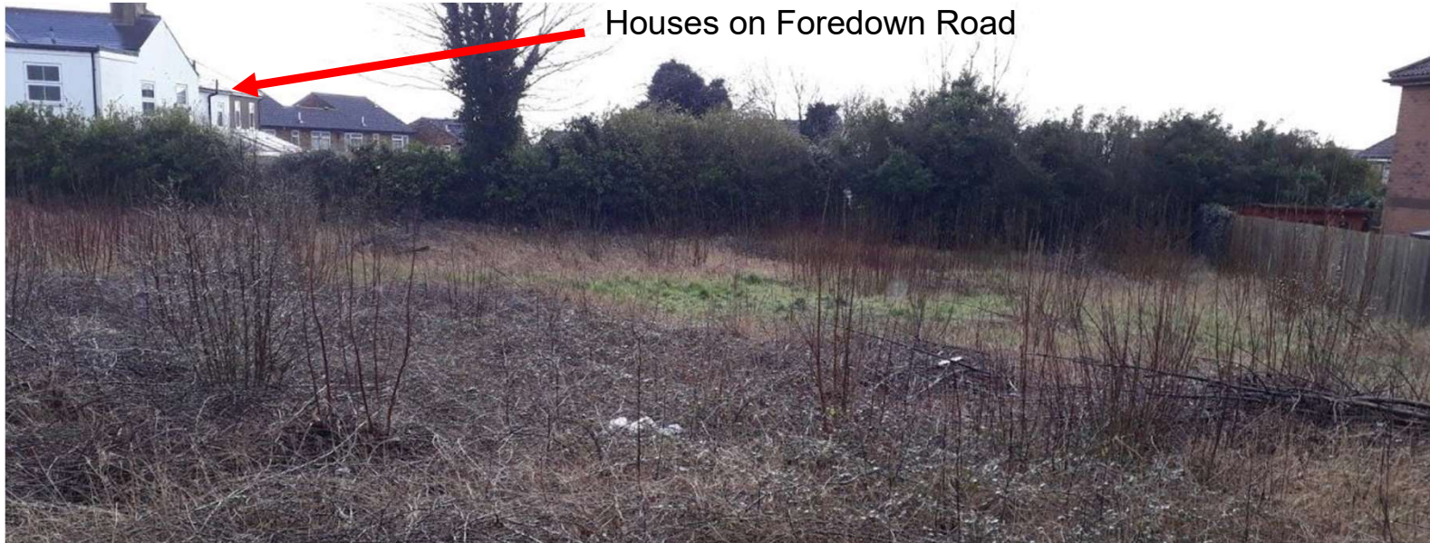
Houses on Foredown Road